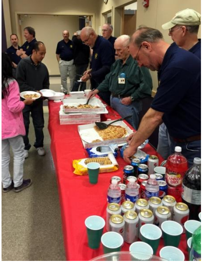
Some of the Pizzas